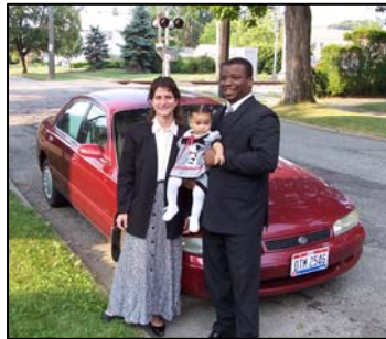
In front of our "Chariot"