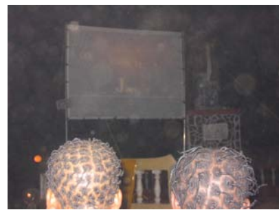
The first showing of Jesus in the Lokaa Language in Ugep, Cross River State, Nigeria.

PHASE 1 of this campaign involved a rural focus and took place from 2004 through the end of September, 2005. Thousands in the rural areas experienced new life through the ministry of the JESUS film in over 80 languages throughout Nigeria. Also, manpower was raised regionally through evangelism trainings and prayer mobilization. In our region, the Southeast, we focused particularly on the cities of Enugu, Calabar, and Onitsha for mobilization.