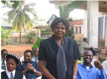
The Enugu Hope West Africa Volunteer Staff at their graduation.

PHASE 2 started on October 1 and will continue until November 30, 2005 . We will focus on 60 major cities in West Africa, more than 40 of those being in Nigeria. Each of our regional ministries has plans to reach the cities in their region using various creative strategies including campus seminars, drama, HIV/AIDS awareness, bus evangelism, executive outreach dinners, market women and taxi driver outreaches, plus many more. In the southeast,