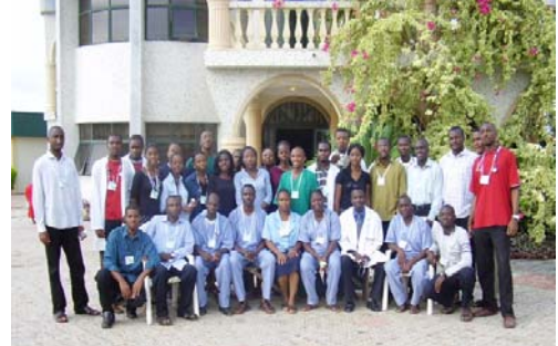
Medical doctors volunteering in the Anambra State outreach.

Tears of joy flowed freely from people's eyes as they received both spiritual and physical help. There was this woman who had abandoned her son to fate. The son had a lethal tumor around the groin and there was no money to seek medical help. The medical team performed surgery on the boy and he became well. The woman exclaimed, "You mean this is free?! This must be God!"