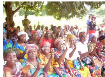
Women choosing to receive Christ in Anambra State.

HWA was a success story. God answered prayers. In the 7 states of the Southeast region that we cover, with a population of about 30 million people, various strategies were used to share Christ. These were Jesus Film shows, medical outreaches, seminars, video distribution and prison ministry. 193,400 people were presented with the gospel and out of this number 56,000 of them prayed to receive Christ. More than one tenth of this number started follow up lessons. In addition, we partnered with many churches, non-governmental organizations and Christian organizations to do outreaches. 12 churches were planted in our region of Nigeria.